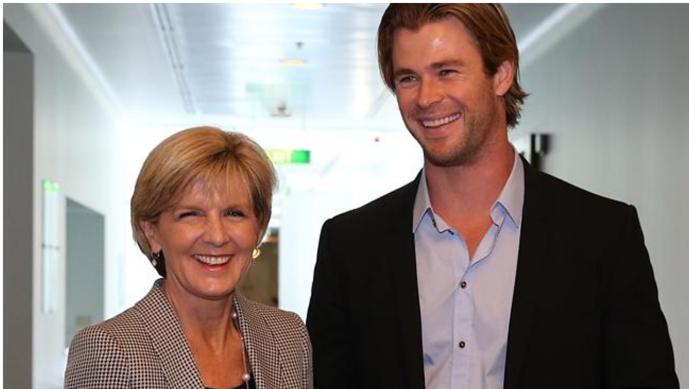
Foreign Affairs Minister Julie Bishop is all smiles with actor Chris Hemsworth at Parliament House today.

A CHANCE meeting at the footy saw actor Chris Hemsworth make a surprise appearance at Parliament House today.