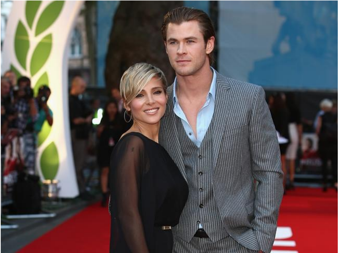
On the red carpet in 2013 with his wife Elsa Pataky.

There’s no doubt that Hemsworth’s public profile is also an asset.